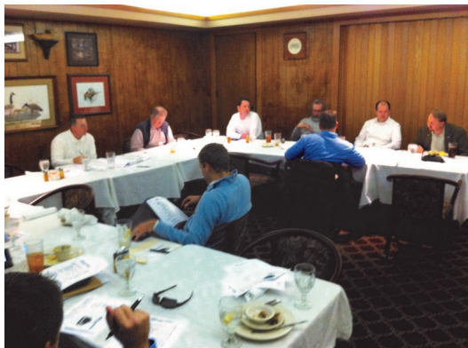
Board of Governors at Sportsman's Club on October 29, 2012.