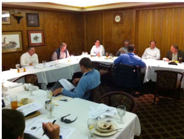
Board of Governors at Sportsman's Club on October 29, 2012.