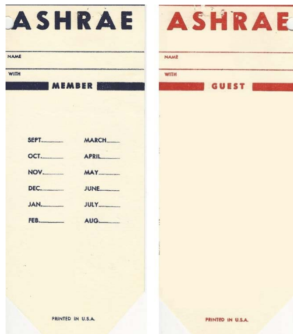
Photo 1 - Old paper nametag, circa 1965. Front and back